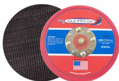
SPBP5 Backup Pad