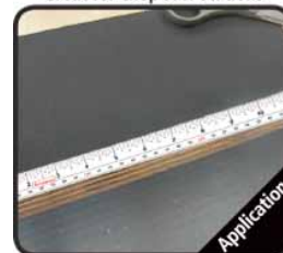
Great for layout & cutting stations