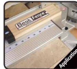
Great for chop saw stations