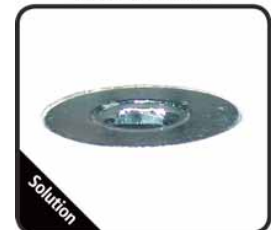
Flush with the surface