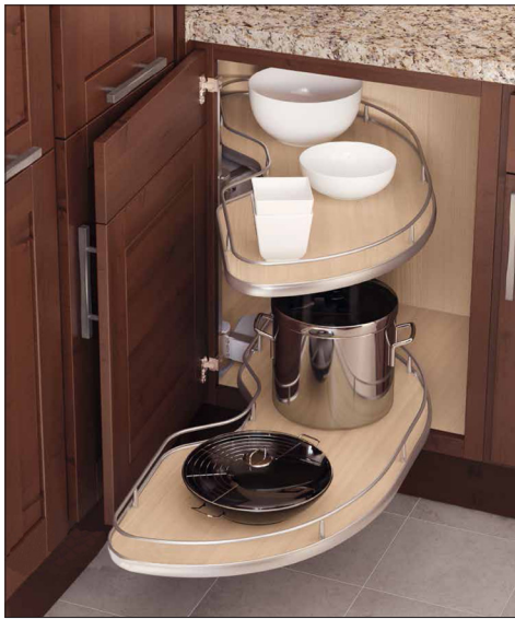
Right Hand unit shown