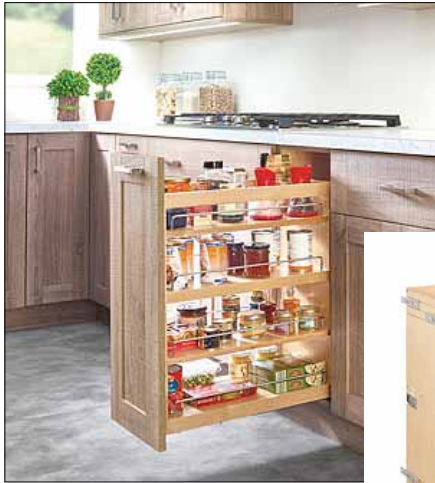
449-BCSC Base Pullouts