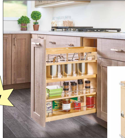
449UT-BCSC Utensil Base Pullouts