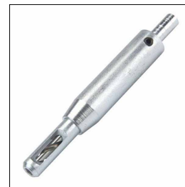
Use vix or hinge bit to center holes